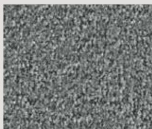
▲ SB: LMIN.0850 | 400 cm