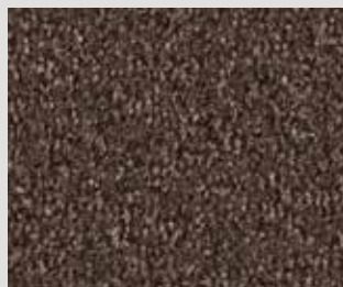
▲ SB: LMIN.0210 | 400 cm