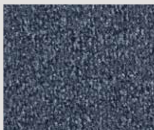
▲ SB: LMIN.0720 | 400 cm