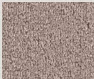
▲ SB: LMIN.0230 | 400 cm