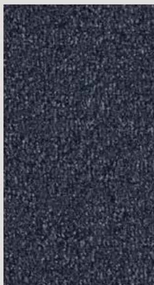
▲ SB: LMIN.0780 | 400 cm