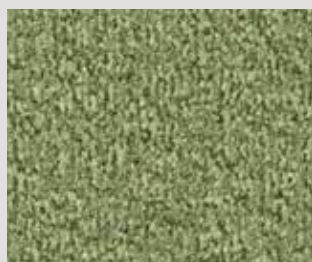
▲ SB: LMIN.0520 | 400 cm