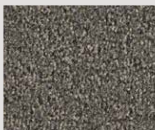
▲ SB: LMIN.0830 | 400 cm