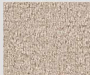
▲ SB: LMIN.0250 | 400 cm