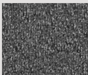
▲ SB: LMIN.0820 | 400 cm