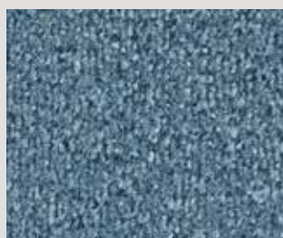
▲ SB: LMIN.0730 | 400 cm