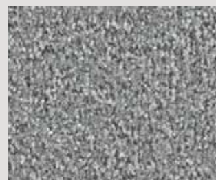
▲ SB: LMIN.0870 | 400 cm