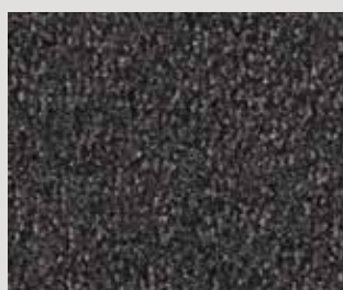
▲ SB: LMIN.0810 | 400 cm