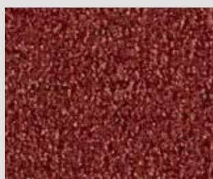
▲ SB: LMIN.0120 | 400 cm